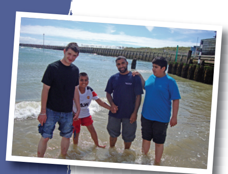
Out and about

Above all, we never forget that the needs of our clients always come first.